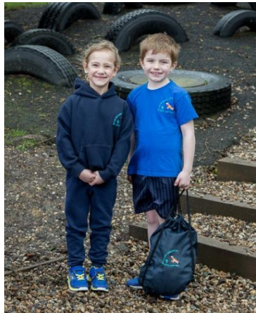
Ladybirds & Woodland PE Kit

Please make sure your child is wearing school PE kit on Thursday 8 th July. They will also need to be wearing trainers. Please apply suncream before they leave the house and ensure they have a hat and water bottle in school with them.