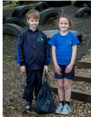
Kestrel & Osprey PE Kit

Well done and thank you! The Sponsored Skip has raised £800! Thank you to the PTA for organising this event for our children! The skipping ropes will be delivered on Monday.